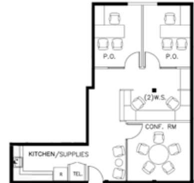
Suite #202 - Option #1