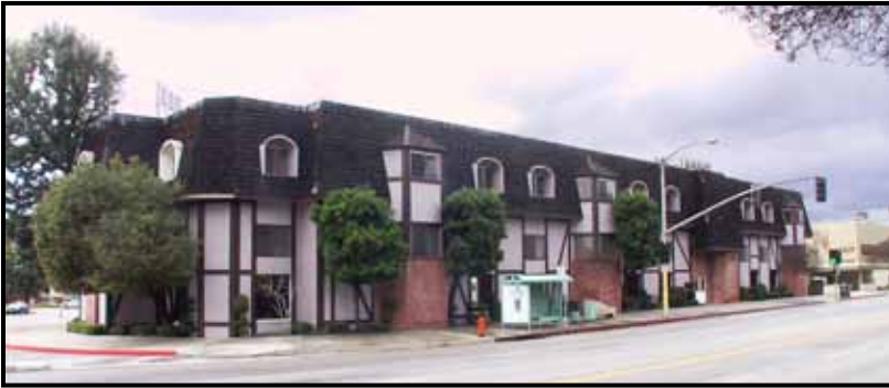
Suite #202 924 Square Feet

Only a few remaining suites - 3,051, 924 & 398 square feet