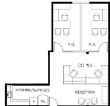
Suite #202 - Option #2

Brand New Tenant Improvements - MOVE-IN READY Only $1.75 per foot fully serviced